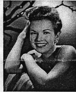
Gale Storm In My Little Margie